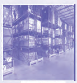
CAVALIER'S 100,000+ Sq. FT. FACILITY ADJACENT TO DULLES AIRPORT.

For more information on how Cavalier can quickly, securely and costeffectively solve your specific logistics, storage and distribution needs,