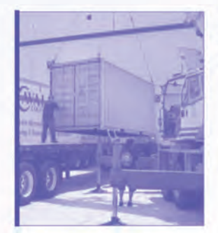
20' OR 40' OCEAN CONTAINER SERVICE.

Cavalier Logistics' mission is to serve our customers in the global logistics and cold chain markets by providing creative, cost-effective supply chain solutions that continually meet and exceed our customers' expectations and provide unquestionable value. We are committed to our relationship with our customers and their success. We strive to inspire our customers, partners and vendors to be the valued members of our team that we are to theirs and to serve them and the communities within which we work with integrity and responsibility.